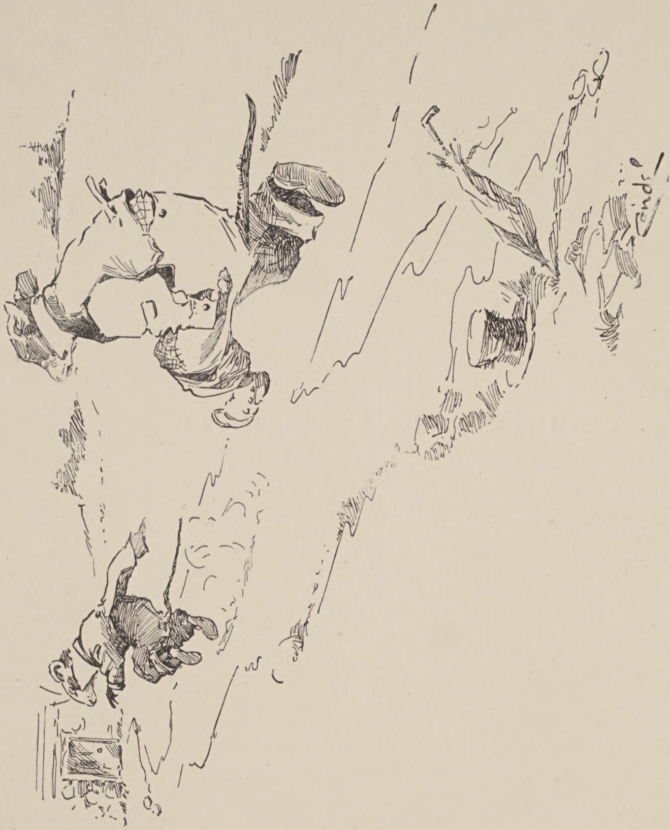
SMALL DOG CHASES GRAY MOUSE HOME.